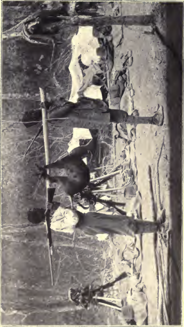
BRINGING HOME THE GENERAL'S DINNER.